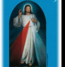
The Chaplet of Divine Mercy

When your loved one is facing imminent death call 610.413.0949 any hour of the day or night and the Divine Mercy Chaplet will be recited for him or her.